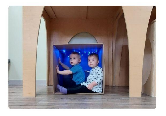
Program of the Fort Saskatchewan and Sturgeon Region Family Resource Network